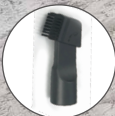
Floor brush and crevice tool