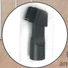
Floor brush and Crevice tool